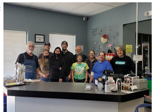
Members volunteer at Joy Closet in January.