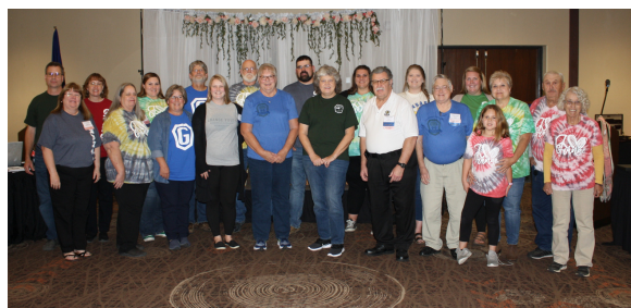
Kansas Grangers sport their favorite Grange shirt at State Session. Many members purchased tie-dyed shirts to support the Youth!